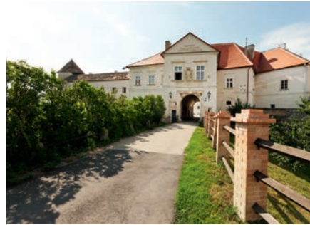
Castle winery of the Sovereign Order of Malta Weinviertel Mailberg