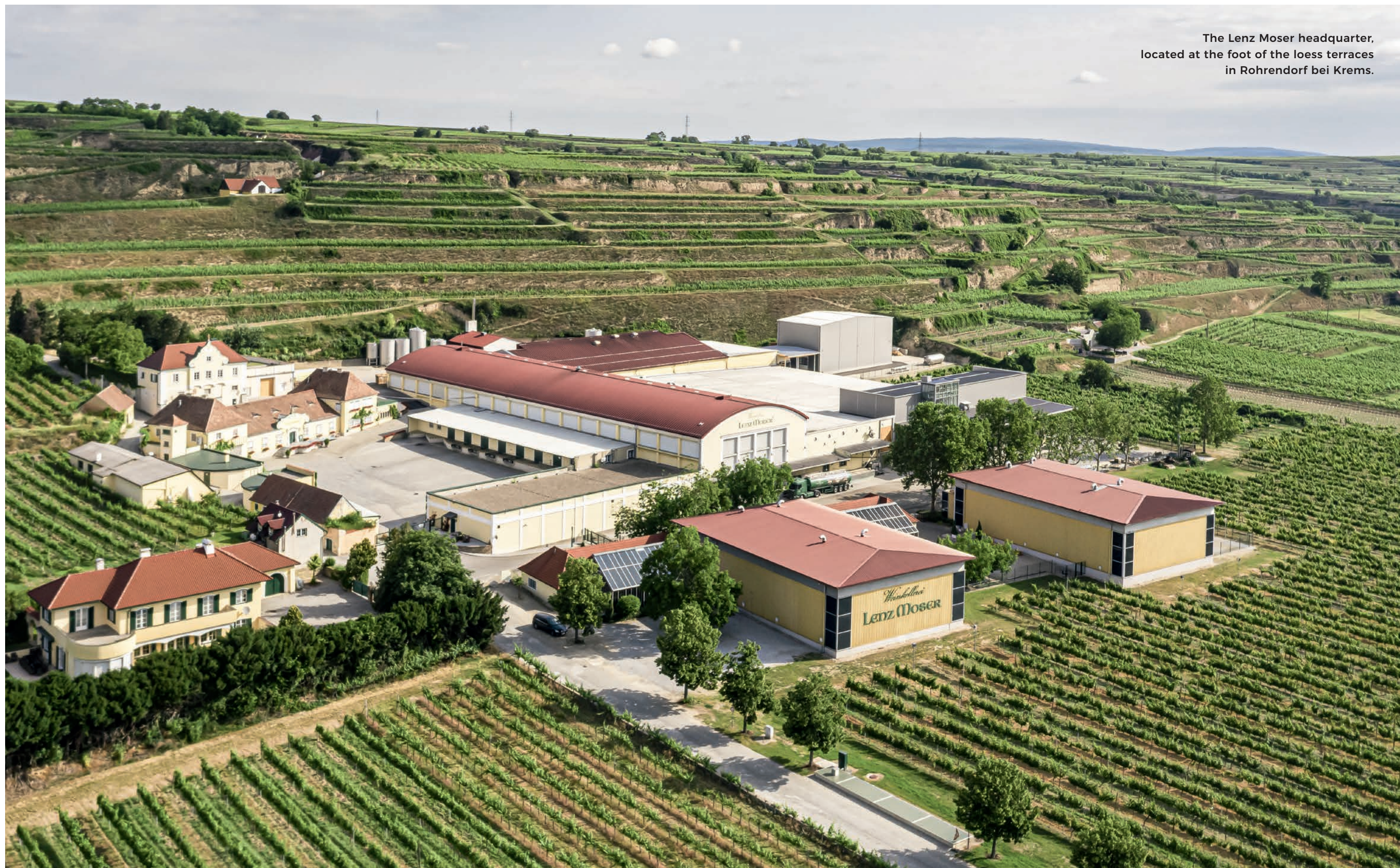
The Lenz Moser headquarter, located at the foot of the loess terraces in Rohrendorf bei Krems.