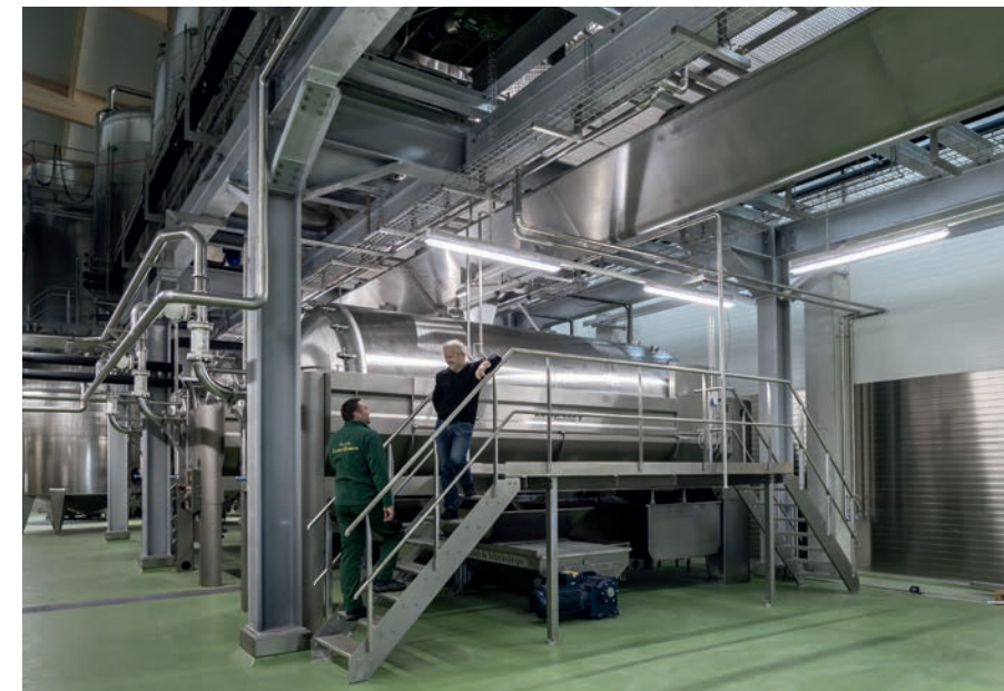
Fit for the future: the modern press house allows for rapid processing of the grapes whilst consistently cooling them.

Those who enter our old wine cellar can literally breathe in our history. Our top wines mature in French barrique barrels, large wooden barrels and the legendary 1,000-bucket barrel. The microclimate of our over one thousand-year-old cellar provides optimal conditions for our wines to mature. Here one can also find our well-preserved treasures, wines from the last century , ready to delight the wine lover's palate. In order to be able to look back on a glorious past, we trust in gentle processing methods and uncompromising quality control, or rather the trained senses of our oenologists. With our modern press house , we are setting new standards and raising the bar. Fully automated systems allow us to cool and weigh the harvest, determine the quality and separate the grapes thereafter. In doing so, we are able to guarantee that Lenz Moser remains what it has always been: an important ambassador of Austrian wine culture .