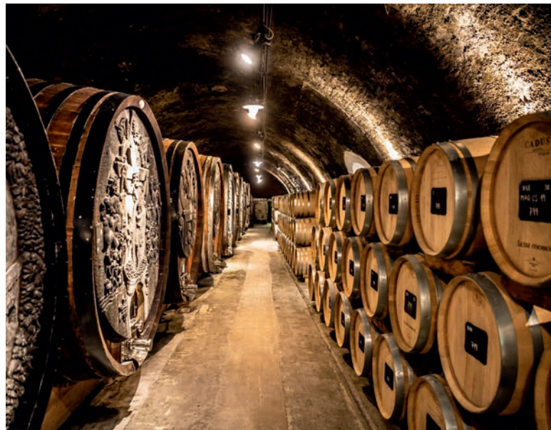
The history of our wine cellar goes back to 1040. Here our top wines are matured in over 850 barrique barrels and 17 large wooden barrels.