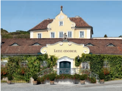
Lenz Moser Winery Rohrendorf bei Krems