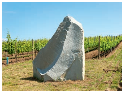
Klosterkeller Siegendorf Winery Leithaberg Siegendorf

Lenz Moser Straße 1 3495 Rohrendorf bei Krems